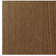
LIGHT SMOKED OAK