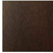
DARK SMOKED OAK